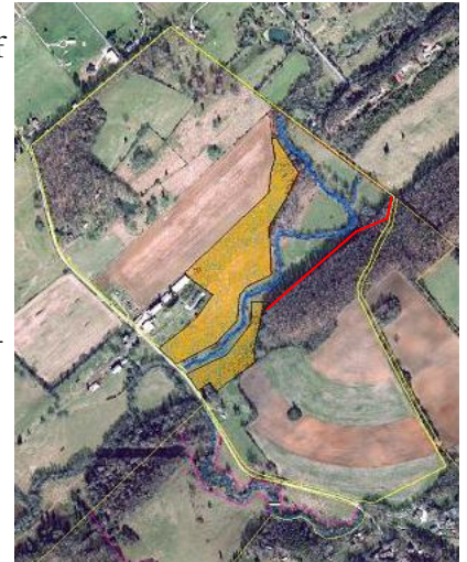
This aerial photo of the Harris farm highlights in red plans for the stream's buffer boundary.

Over the past few months we have been fortunate to work with Greg Babbit of Blue Ridge Waterways & EcoFLOW Consulting in Maryville on a streambank mitigation project on Nails Creek at the Gail Harris farm (Blount County). Plans are nearly complete and will include removing or fencing cattle away from stream access and spring area of the property. Efforts are also focused on restoring the stream bank contours, removing exotic invasives, and planting at a 50 foot buffer along the stream in native trees and shrubs to help hold the soils and create habitat. Native plantings will also be made to restore the spring area where cattle have previously had access. The Harris property already has a conservation easement with FLC but additional conditions will be included that pertain to the restored area so that it remains protected in perpetuity.